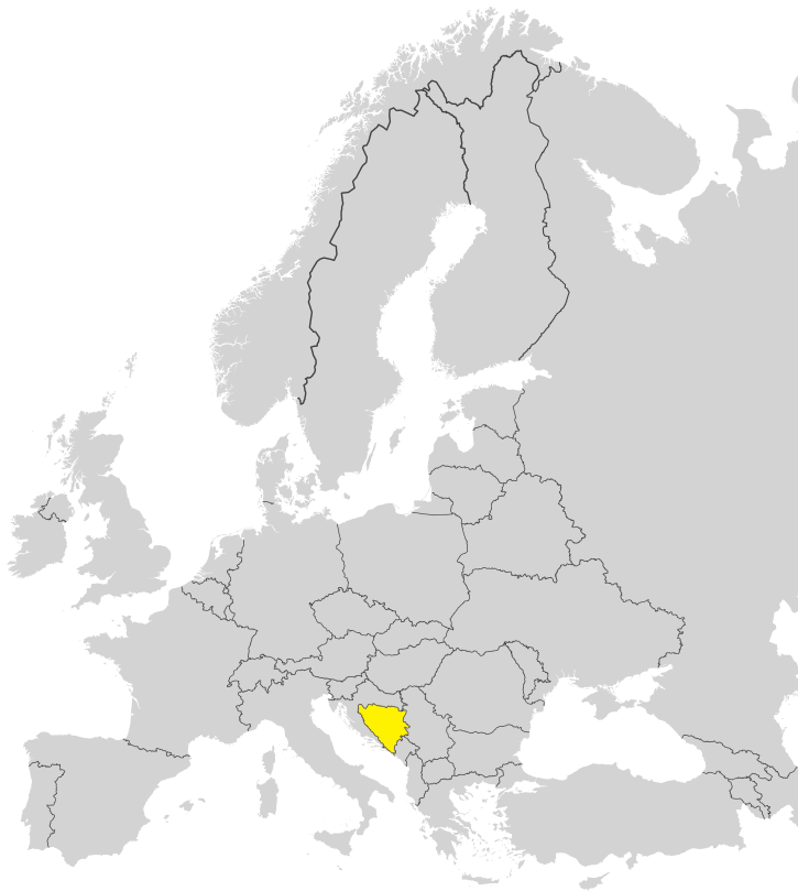
Position of Bosnia and Herzegovina (BiH) in Europe