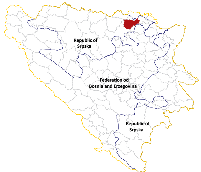
Position of the Municipality of Modriča in the Republika Srpska and Bosnia and Herzegovina